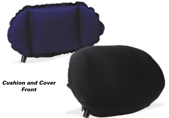
Cushion and Cover Front