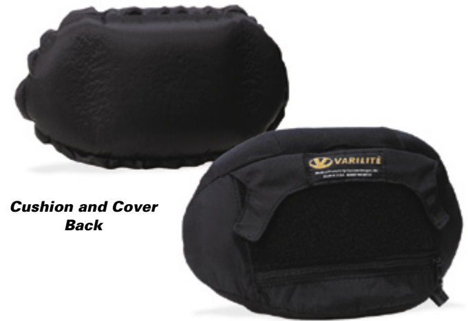
Cushion and Cover Back